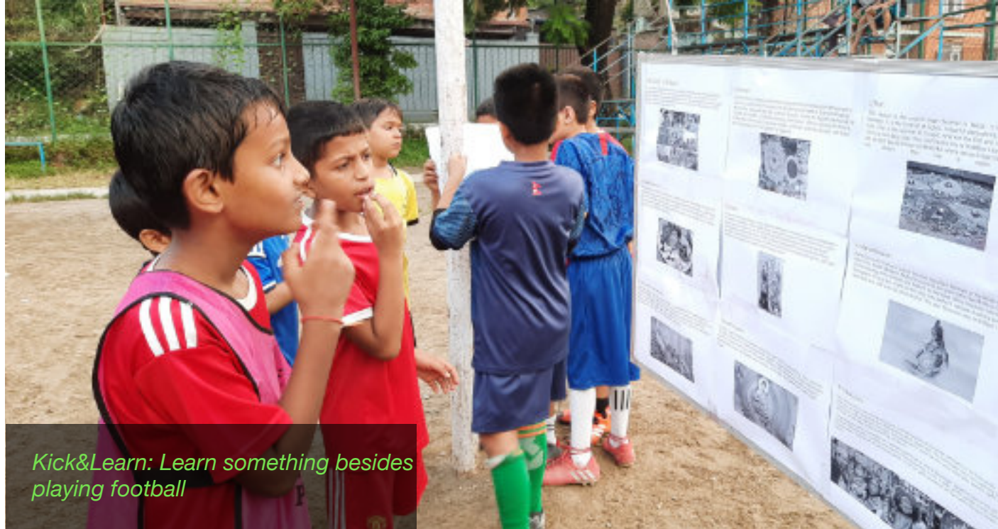
Kick&Learn: Learn something besides playing football