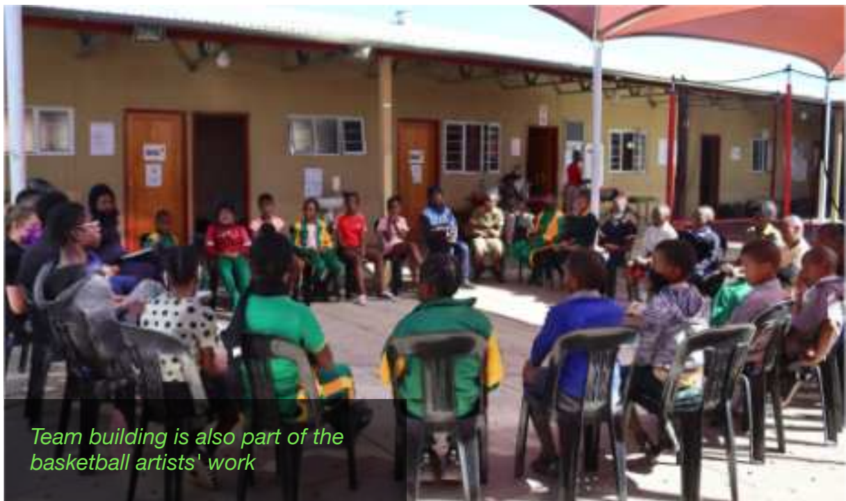
Team building is also part of the basketball artists' work

Since 2019, we have been helping BAS to finance its after-school programme. Every day, sixty children and young people from poor families in Katutura township receive a hot lunch. This not only increases the appeal of BAS, but also has educational significance for healthy eating. That is why we bear part of the cost of the food purchases right from the start. For the subsequent tutoring and remedial lessons as well as the "life skills" training, we have made it possible to purchase electronic learning material. Only after the remedial lessons does the basketball training become a new attraction of the afternoon programme.