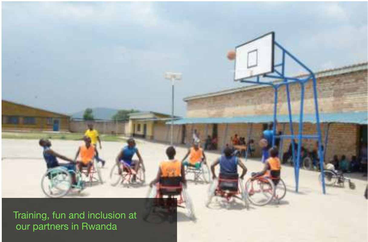
Training, fun and inclusion at our partners in Rwanda