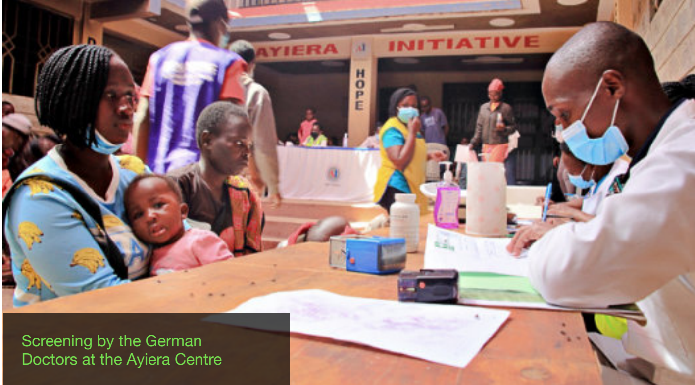
Screening by the German Doctors at the Ayiera Centre

Because our foundation as a trust foundation does not have full legal capacity, in December 2020 all members of the Foundation Council had decided to establish our association of the same name "Zukunft für Kinder in Slums e.V.". Since all members of the Foundation Council and the Chairman of the Foundation's Board of Directors form the Board of the e.V., full cooperation is guaranteed. After the foundation's establishment, the foundation board entrusted the e.V. with the task of also implementing the foundation's project policy.