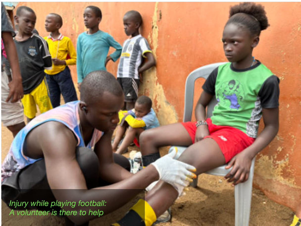
Injury while playing football: A volunteer is there to help